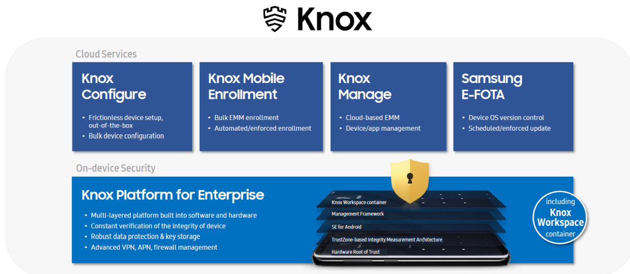
Figure 3-1: Knox Platform Diagram